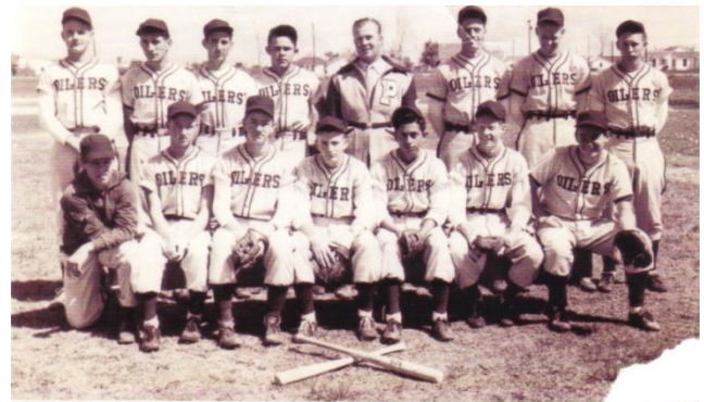
1951 PHS District Champions – At home field Zychlinski Park