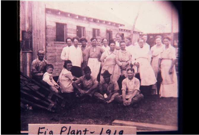
Fig Plant Workers – Picture taken in 1919

This is the one canning factory that was not promoted for the promoters' benefit, but for the good of the grower and as an aid in developing the fertile country around the little city of Pearland.